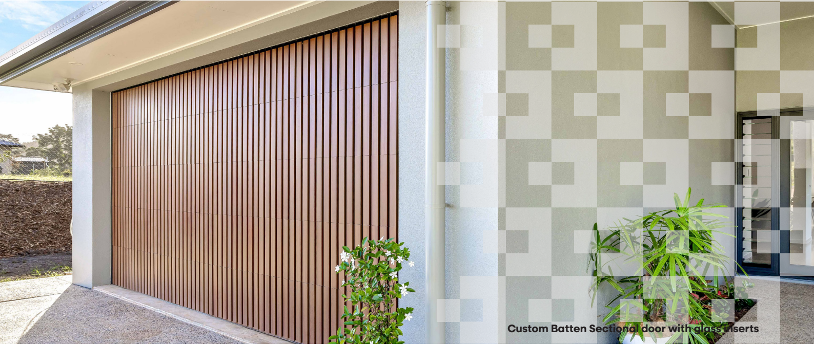
Custom Batten Sectional door with glass inserts